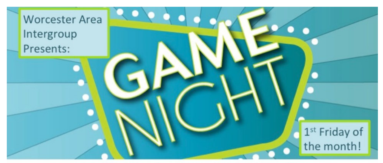
Join Worcester Area Intergroup Social Committee for a night of fun and games!

6:30pm Potluck | 7pm AA Open Speaker Discussion meeting | 8pm GAME ON!!